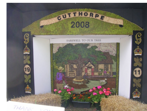
Cutthorpe Well Dressing