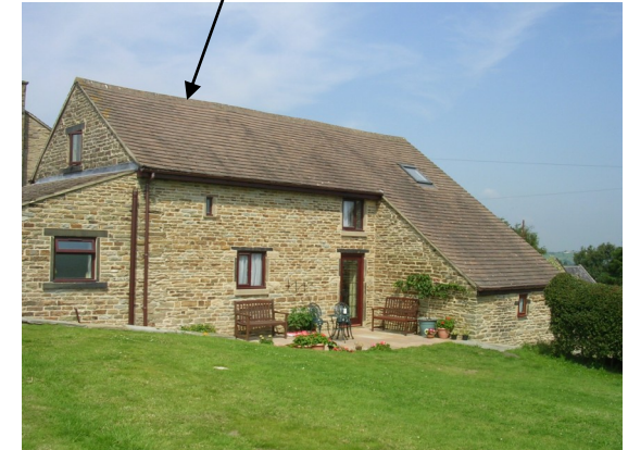
The Robins, Cowclose Barn

SELF-CATERING COTTAGE IDEAL FOR COUPLES OUR MINIMUM STAY IS 2 NIGHTS