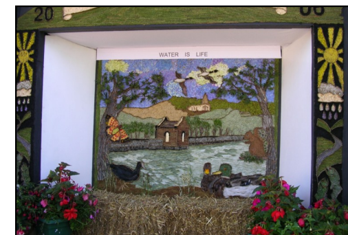
Cutthorpe Well Dressing