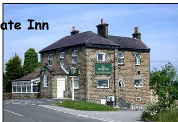
The Gate Inn

As the Robins has a downstairs bathroom, and a sofa bed in the lounge, it may be suitable for guests with limited mobility.